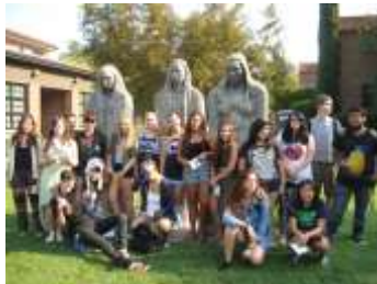
CSUC Field Trip