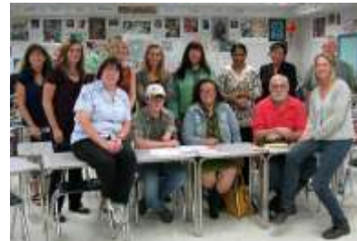
Art Community Advisory Board